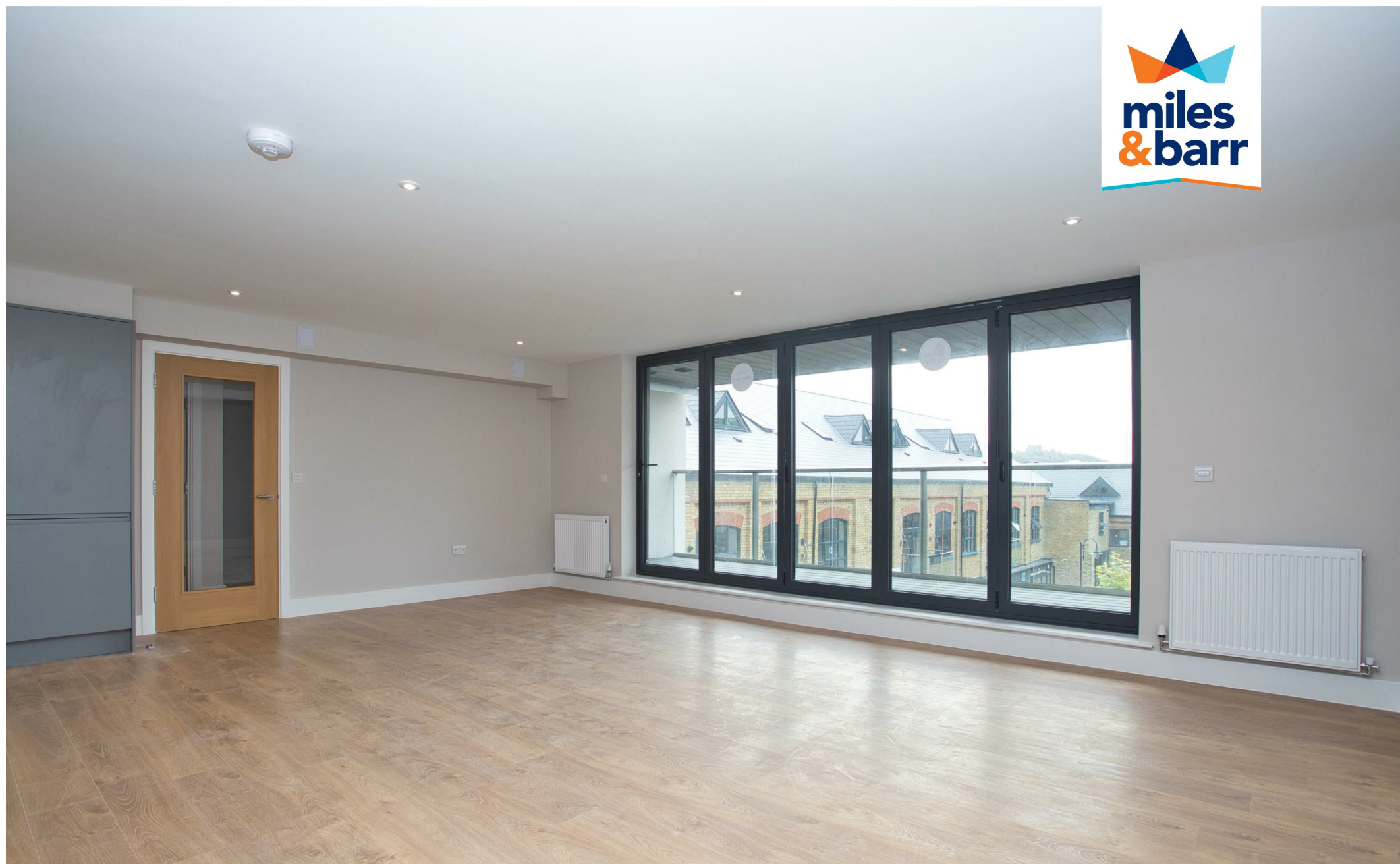
F6 APARTMENT 5, WATERWHEEL HOUSE CRABBLE HILL DOVER